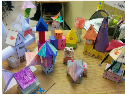
Congratulations to all Math Week participants!

In December, the school hosted our signature annual event—the Week of Mathematics. Every day of that week was dedicated to a mathematical "holiday": a Day of Logic, a Day of Geometry, a Day of Puzzles, and a Day of Mathematical Contests. Our students prepared and presented over 100 amazing projects in which they discussed the history of mathematics, its wonderful discoveries, and the role of mathematics in the modern world. The middle school students worked on mini research projects and created their own math problem collections for the younger students. Our 5th and 6th-graders prepared and held mathematical contests in 3rd and 4th grades. Every grade level held a 3D math model competition. Students had composed poems about mathematics and designed miniature math books for younger students.